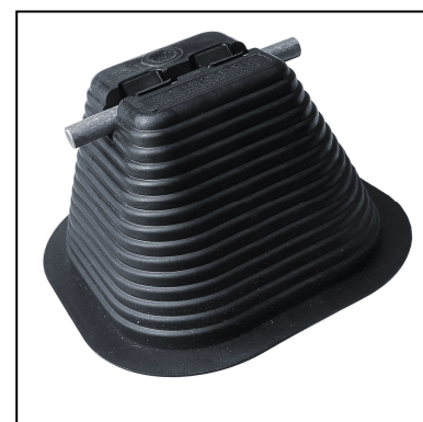
Pyramid holdfast type 45 01 16 (without bottom) and 45 03 16 (with bottom) without adapter 45 22 17.