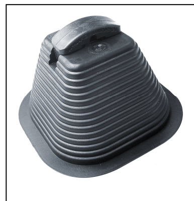
Pyramid holdfast type 45 01 16 (without bottom) and 45 03 16 (with bottom) with adapter 45 22 17.